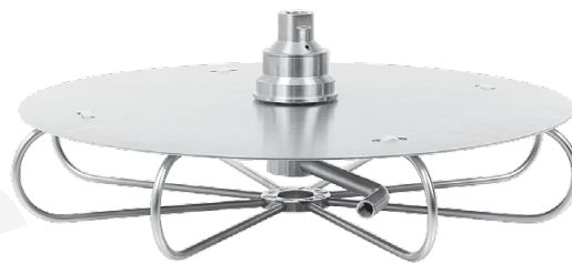
TYR-2f with protective plate